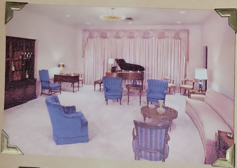
South end of the Annie Webb Blanton drawing room..