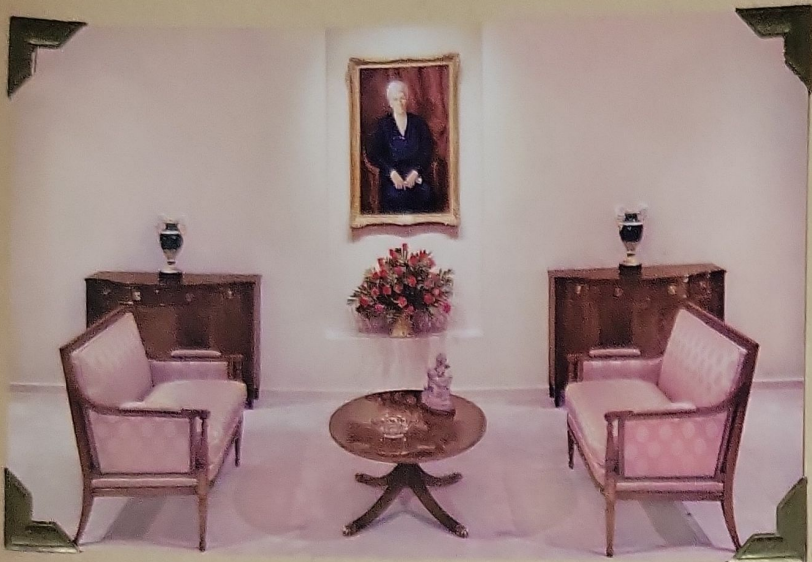
North end of the Annie Webb Blanton drawing room.