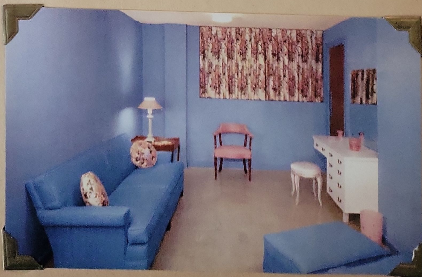
The Powder Room in the International Building.