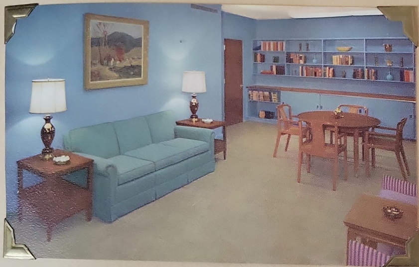
Library of the International Headquarters of the Delta Kappa Gamma Society.