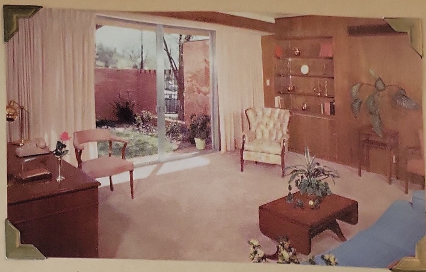
International Executive Office of the Secretary of the Delta Kappa Gamma Society in Austin, Texas.